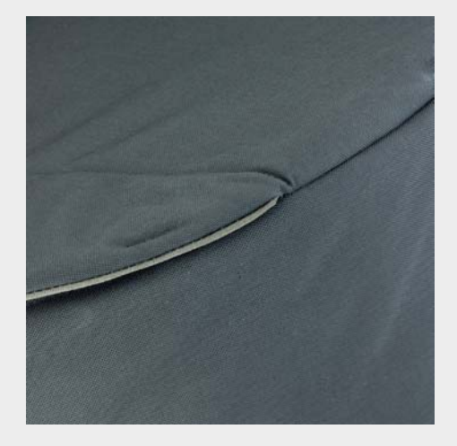
Lightweight and can be used in conjunction with the HBD.