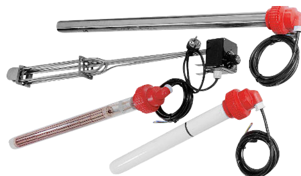
Example of product design