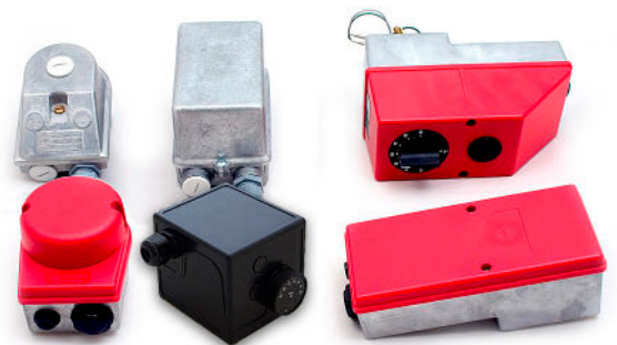
Example of product design