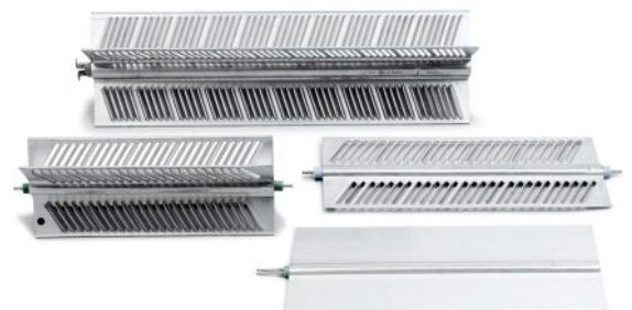
Example of product design