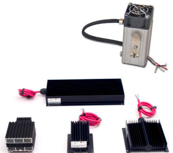
Example of product design