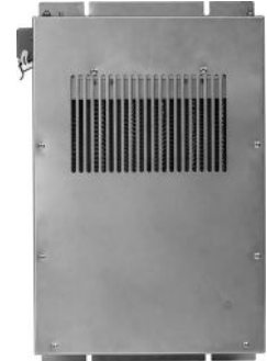
Backer Cabin Heater