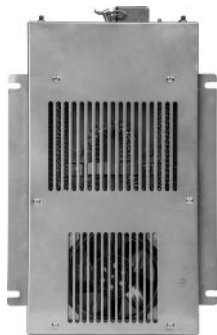
Backer Vestibule Heater