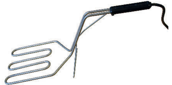
For kettle grills