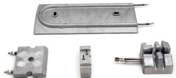
Example of product design