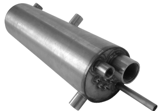
Example of product design