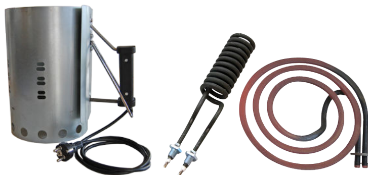
Example of product design