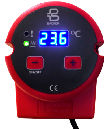
Box max temp 55°C