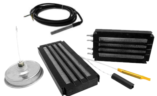
Example of product design