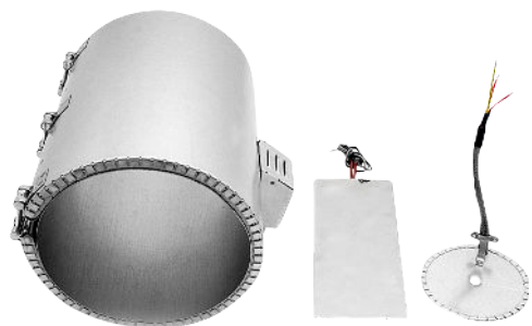
Example of product design