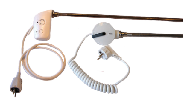
Quick connection to electronic control box