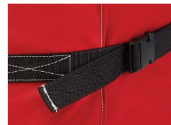
Adjustable nylon straps with buckles