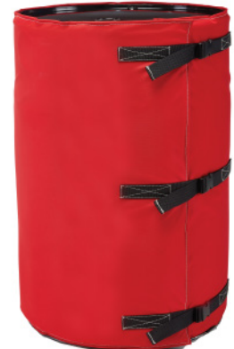
Insulator (FGDIW series)