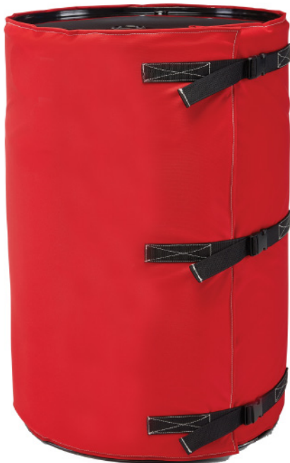
Insulator — Pairs nicely with BriskHeat® silicone rubber drum heaters