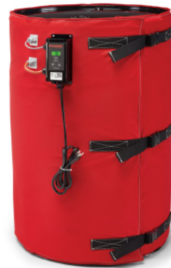
Heater (FGDHW series)