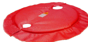
55-gallon (208 liters) insulator cover