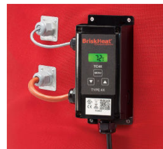
Easy-to-program digital controller