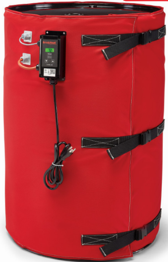
Heater — All-in-one, plug-and-play solution