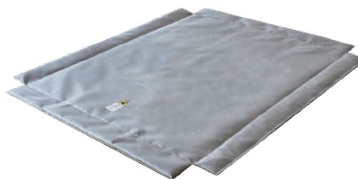
Optional Insulating Cover

Insulation thickness of top cover: 0.25 in (6 mm)