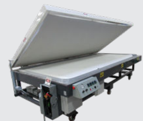
Vacuum Curing/Debulking Tables