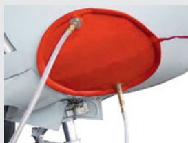
Composite Heating Blankets