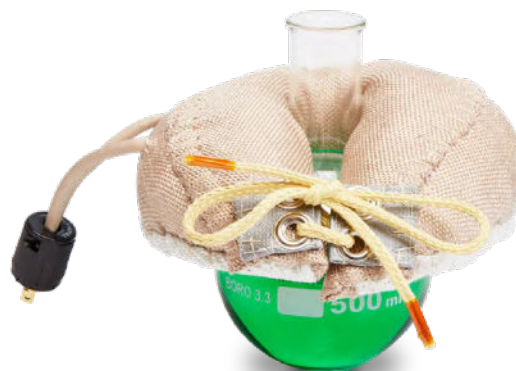
Upper Hemispherical Heating Mantle page 185