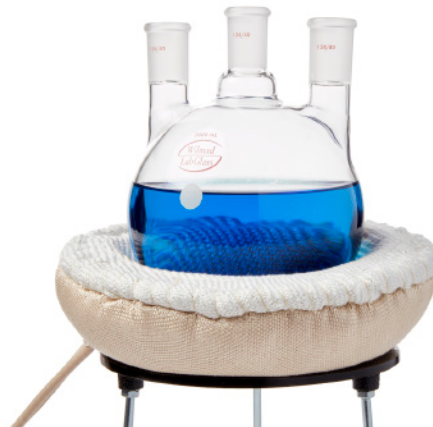
Lower Hemispherical Heating Mantle page 184